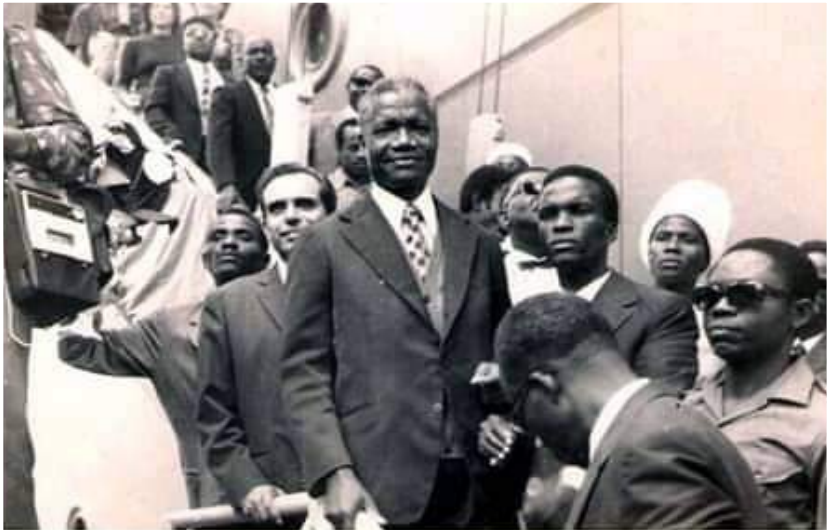
Returning from exile (Azores - Portugal)

He returned from exile (Azores - Portugal) on August 31, 1974, where he had been for more than 11 years. During this period, he led his Church through thousands of Epistles that he regularly sent to Angola and other parts of the world under censorship by the Portuguese colonial authorities.