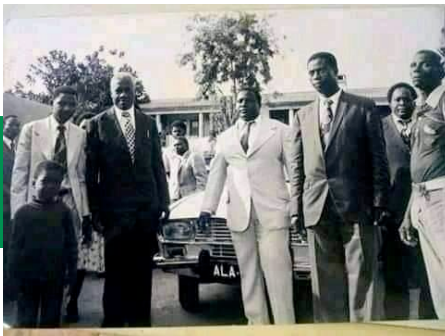
His Holiness on a Pastoral Visit

The Portuguese State only legally recognized the Church of Our Lord Jesus Christ in the World (The Tocoists) in 1974 during the period of political transition to the Independence of Angola, with Admiral Rosa Coutinho as the High Commissioner.