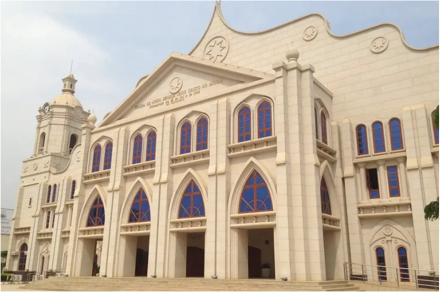
Tocoist Cathedral - Social Administrative Headquarters

The headquarters of COLJCW is located in the Republic of Angola. The Social Administrative headquarters is situated in the city of Luanda and the Spiritual headquarters is in Sadi Zulumongo – Ntaia Maquela do Zombo, Uíge Province.