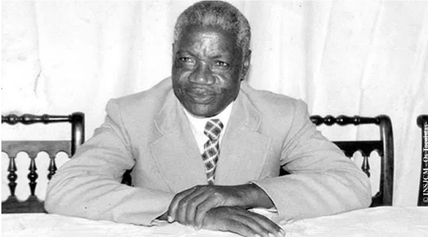
Prophet Simão Gonçalves Tôco

His Holiness Prophet Simão Gonçalves Tôco, the Eternal Leader of the Tocoists, was born on February 24, 1918, in the village of Mbanza Zulumongo, located in Northern Angola, near the border with the Democratic Republic of the Congo (DRC).