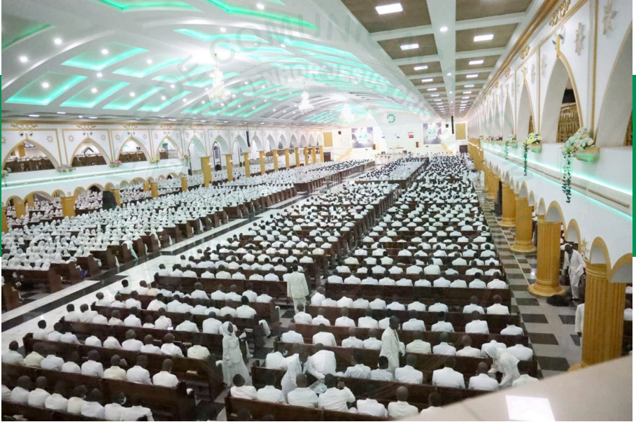
Inside the Cathedral during Worship Service

The Sunday worship service, held weekly, is the primary form of collective worship to God, bringing together the faithful of the local Christian congregation in a single session, typically lasting around 2 hours and 30 minutes. It is usually led by the local highest clerical authority.